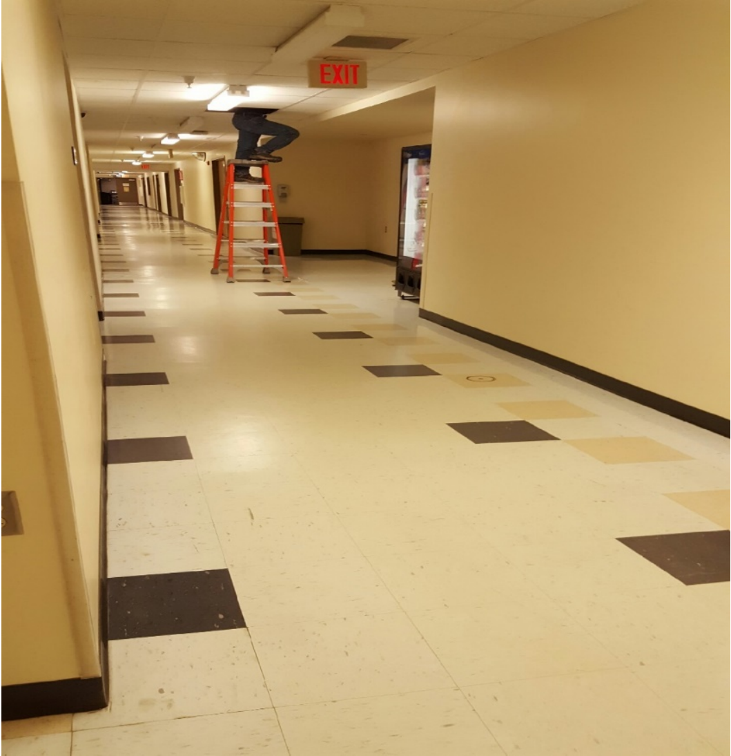
Maine ESOP Fall Conference Program Thursday, September 26 th 2019 Augusta Civic Center